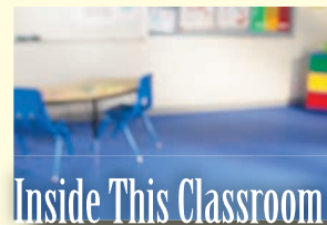
Inside This Classroom

Each month we will feature an essay from the Teacher Appreciation Day 2008 Contest.